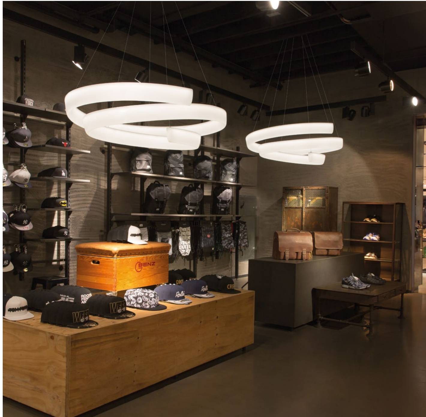
INFECTED CONCEPT STORE GRAZ | AUSTRIA