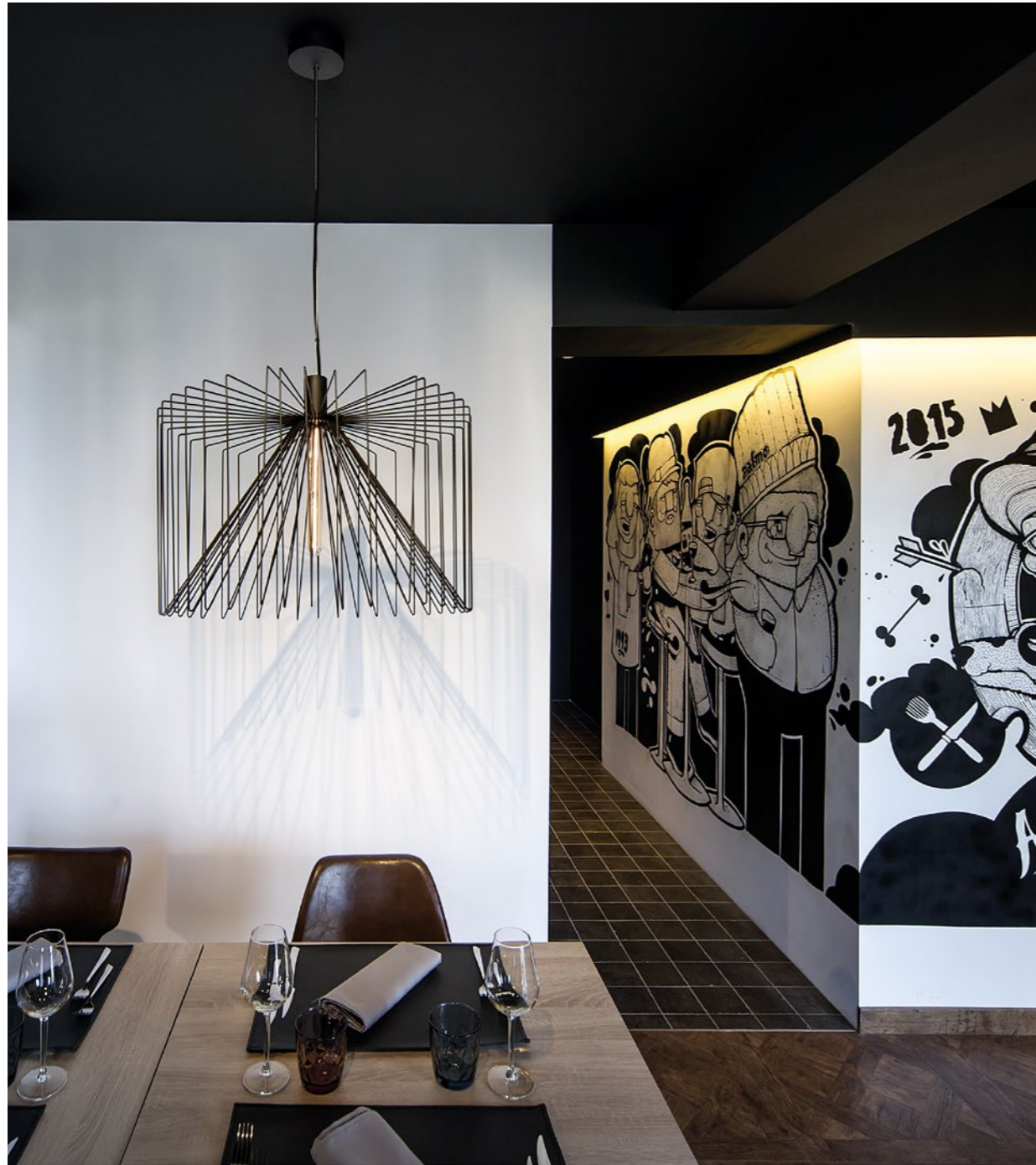
RESTAURANT LE NOIR BONNET | AIXOME ARCHITECTURE SIRAUT | BELGIUM