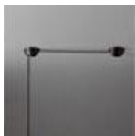
AGGREGATO SOSP ROSONE DECENTA086000