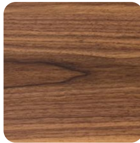
Ash wood: stained walnut