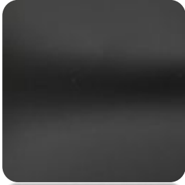
BLACK POWDER COATED