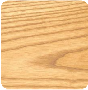
Ash wood: natural