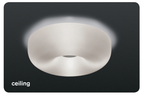
Circus 07 Collection

Go to concept site for Circus 07: www.foscarini.com/circus07