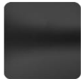
BLACK POWDER COATED