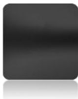
BLACK POWDER COATED