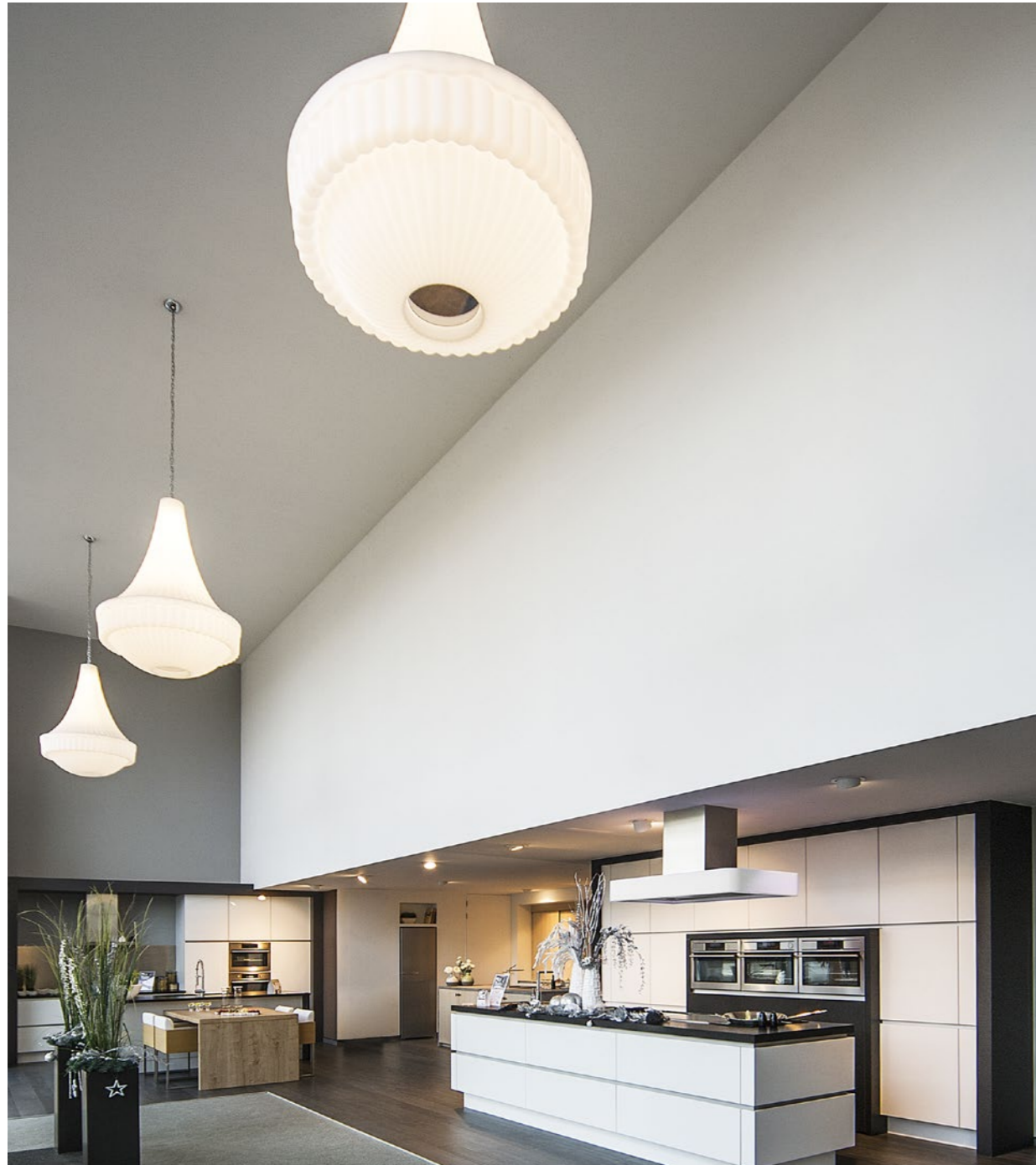
SHOWROOM KITCHEN DOVY ROESLARE | BELGIUM