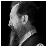
Michele De Lucchi