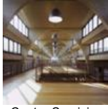
- Centro Servizi MOI