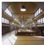
- Centro Servizi MOI