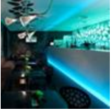
Stefano's Fine Food